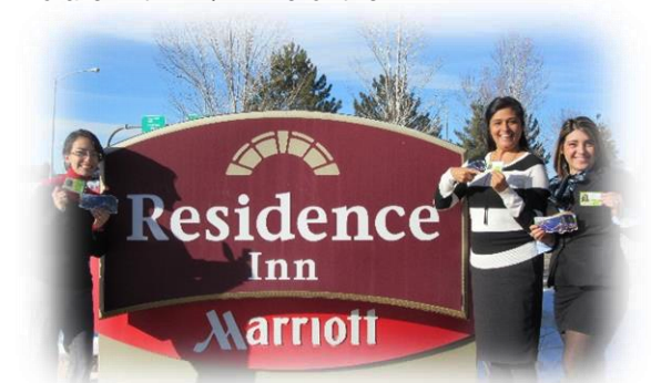
Residence Inn Employees receive their 2016 passes.